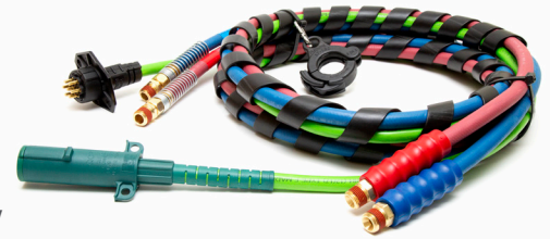
3-IN-1 with STA-DRY® QCMS2™

Cable support that stands up against the elements with non-corrosive housing and adjusts in seconds without tools.