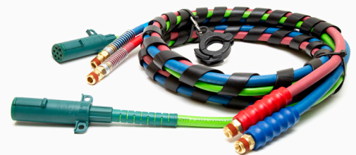
3-IN-1 with QCP™ (Quick-Change Plug)