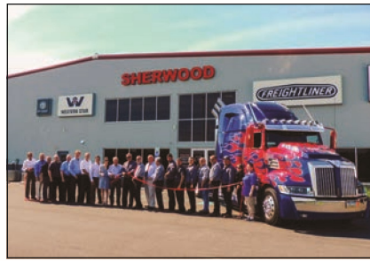
Sherwood Freightliner held a grand opening celebration in June at its new Freightliner, Western Star and Sterling dealership in Drums, Pa.