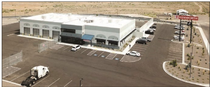
Kenworth Sales Company has relocated its Elko, Nev., facility to a new location in an industrial park near I-80.