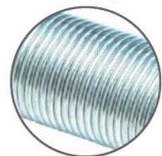
Pre-galvanized hard drawn wire protects from corrosion