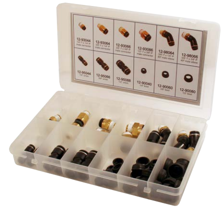
80-1291 48 pieces 6 1/2" x 10 1/2"