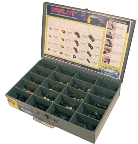
80-1292 110 pieces 12" x 18"