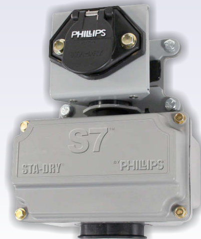
STA-DRY® S7™, HDT'S TOP 20 PRODUCTS OF 2013