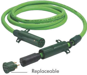
Replaceable Plug Insert