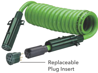
Replaceable Plug Insert