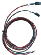
Battery Cable 2.5' 8 AWG