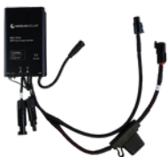
Optimized TS15 Charge Controller with Fuse

110W Panel (73.66 x 14.8 in | 1871 x 376 mm)