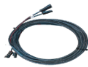
Home Run Cable 50' 12 AWG