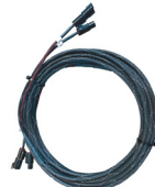
Home Run Cable 20' 12 AWG