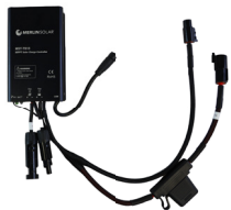
Optimized TS15 Charge Controller with Fuse